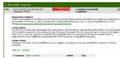
Details of Closure Action Item

LEHR subject matter experts and a DOE specialist familiar with CERCLA requirements created “CERCLA Closure Requirements/Status for DOE Areas” using the available CERCLA template. Action items and important compliance milestones were easily added to the system using a simple form. Editing and formatting were done with tools similar to those used in the past with Microsoft Word. Within days, both Removal Actions and Remedial Actions were clearly documented in a checklist called “CERCLA Closure Requirements/Status for DOE Areas.” The authors added a contextual introduction and specified the expected completion date for each line item.