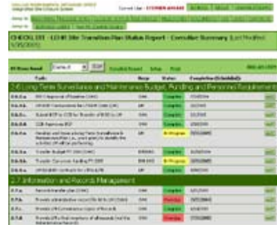
Executive Summary Report

Managers could export snap-shot reports in PDF format for archival purposes or for official deliverables to Department-of-Energy Headquarters. With these formal reports, compliance progress was shared with high-level managers without requiring them to access the system.